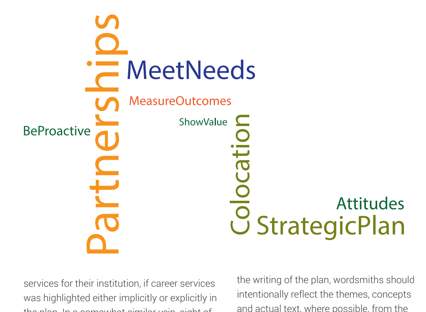
Figure 1: Wordle Representation of Interview Themes

services for their institution, if career services was highlighted either implicitly or explicitly in the plan. In a somewhat similar vein, eight of fifteen focus groups viewed their inclusion in the institutional strategic plan as a testament to the commitment of the institution to career development.